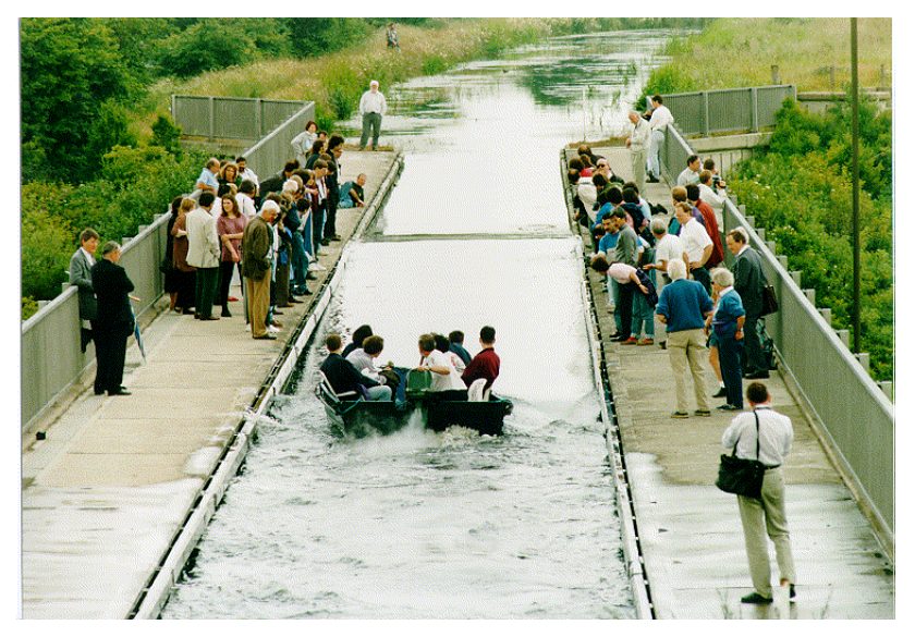
Figure : Recreating Scott Russell's soliton.